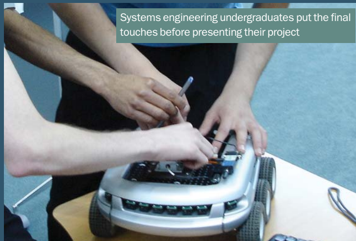
Systems engineering undergraduates put the final touches before presenting their project

companies participate in the development of the course content to ensure its continued contemporary relevance and alignment with their projected future needs.